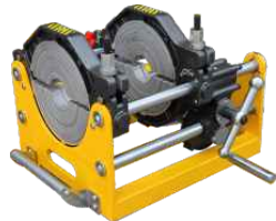
Model WP200C2 2 rings frame