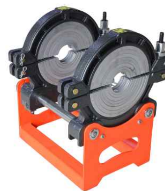
Model D2 series