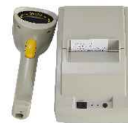
Optional scanner & printer