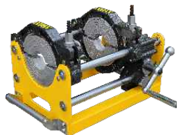
Model WP160C2 2 rings frame