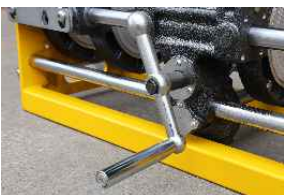
Unique gear transmission design Steady & smooth operation