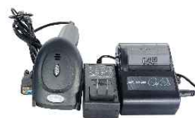
Optional scanner & printer