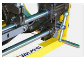
Unique gear transmission design Steady & smooth operation