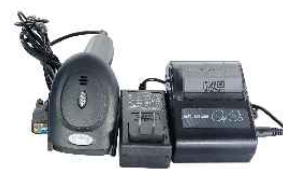
Optional scanner & printer